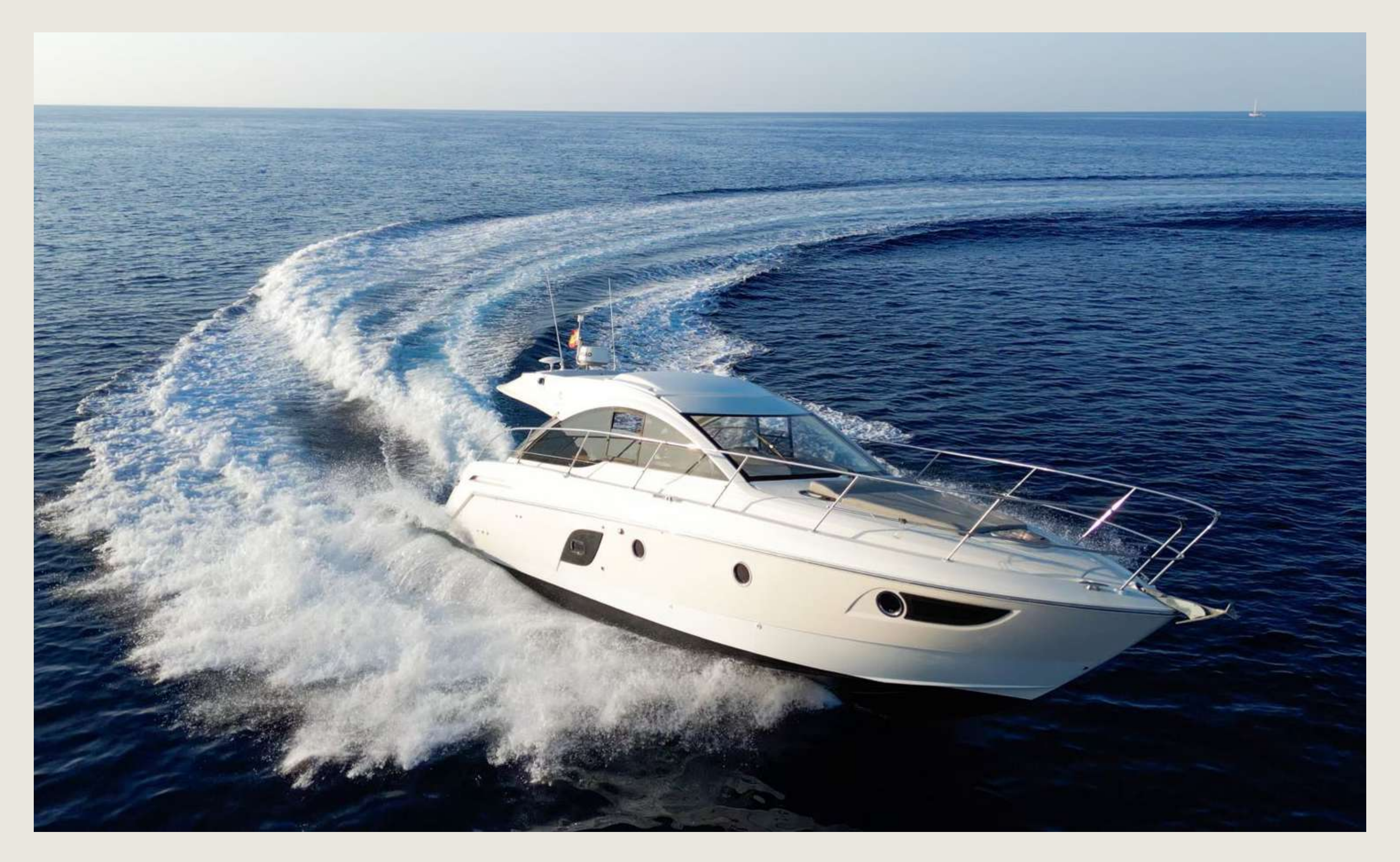
BENETEAU 38 GT