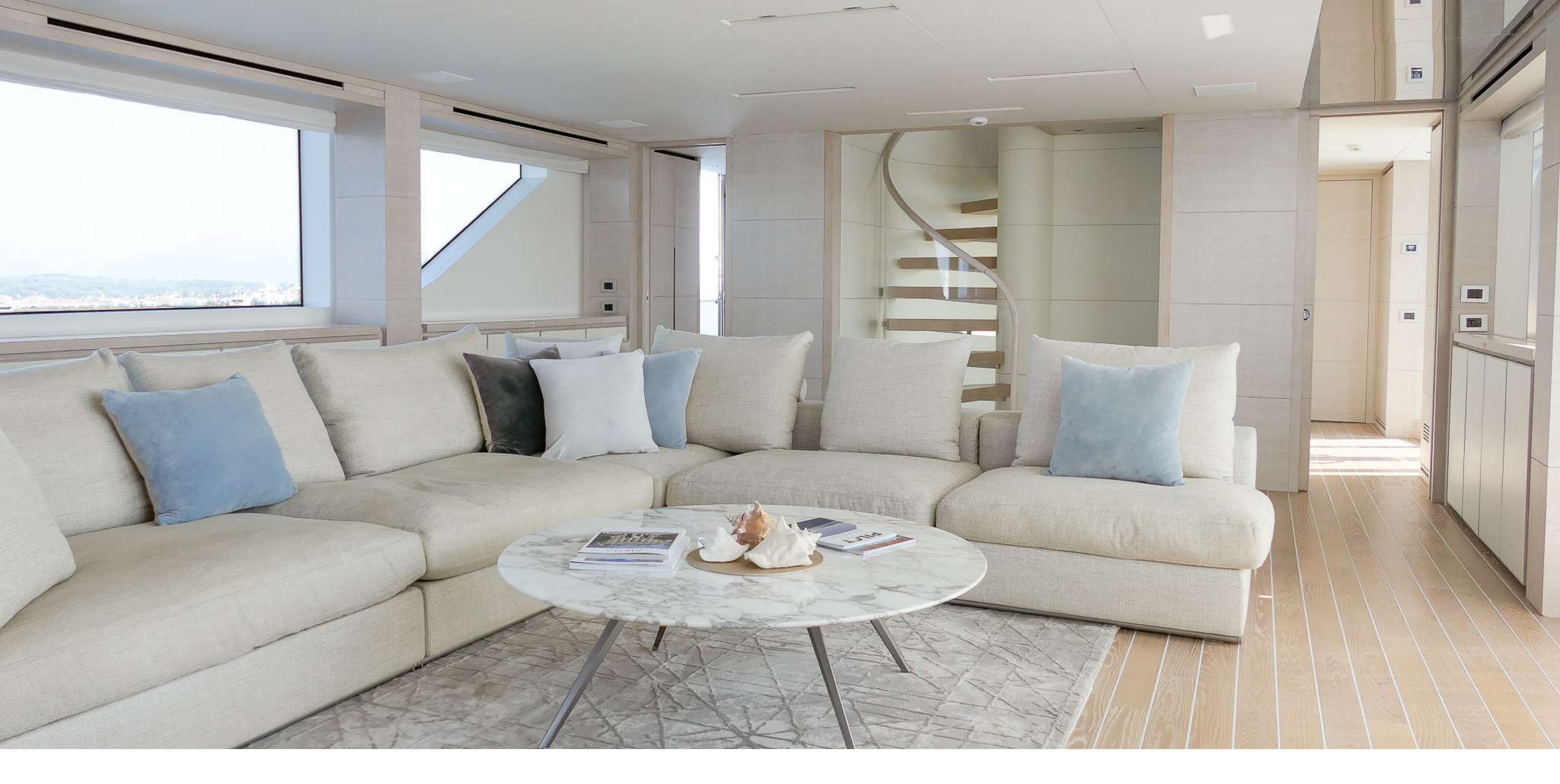
Salon view forward