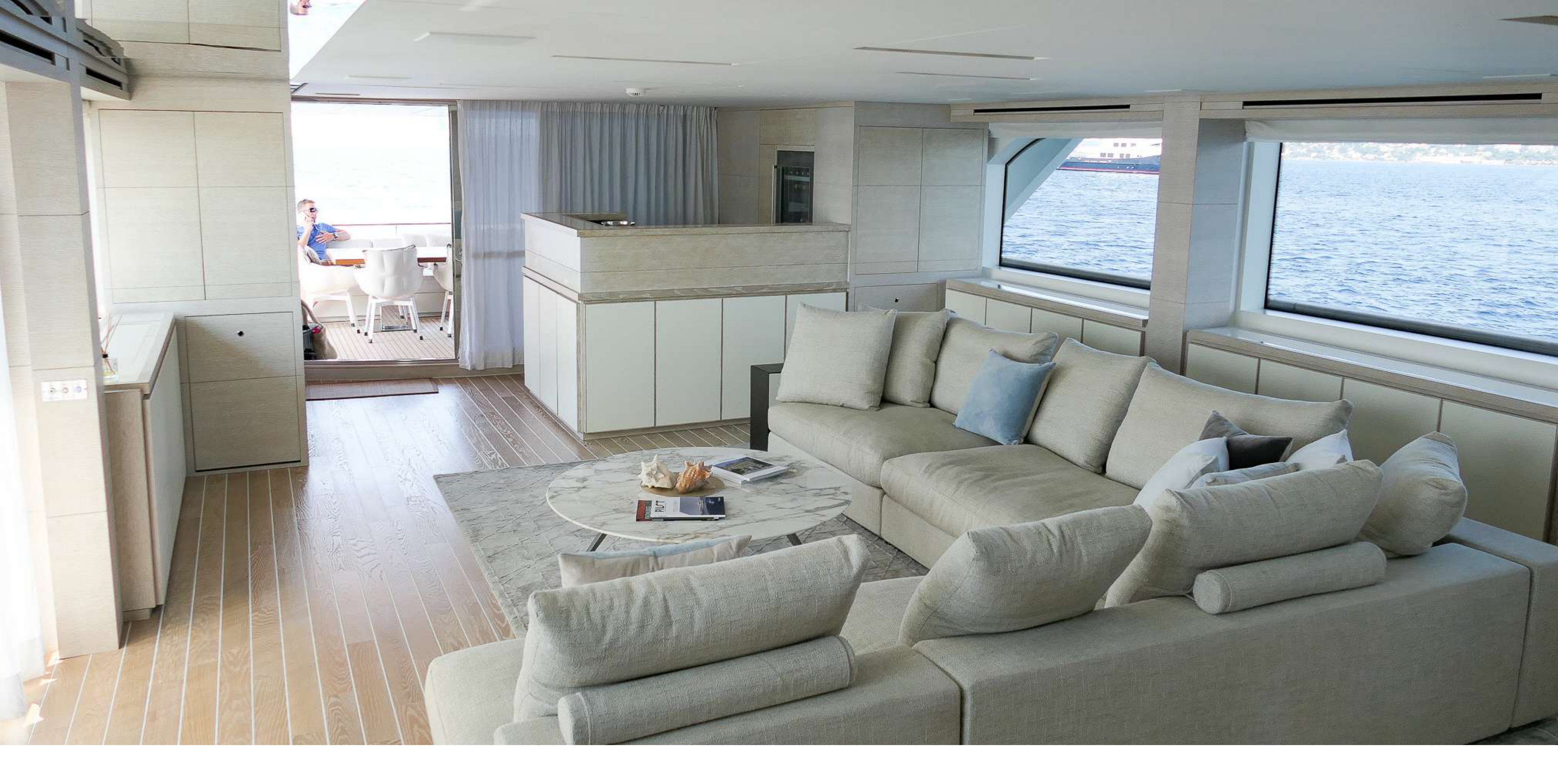
Salon view backward